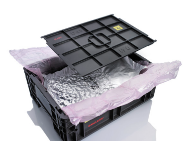
Vacuum packed screws are protected with bubble wrap against shocks during transportation

EJOSEAL 4C can be cleaned (after cleaning the amount of particles is reduced – fading curve). That means it can be used for fasteners with technical cleanliness requirements (EJOCLEAN®).