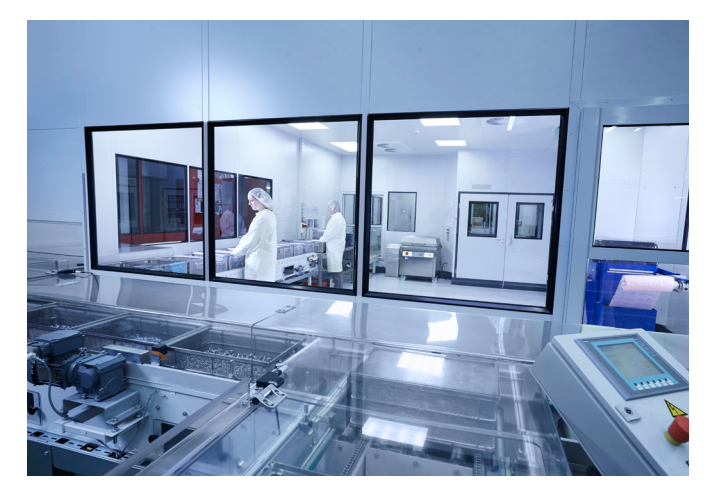
EJOCLEAN® center - where the parts are cleaned according to the specified cleanliness level